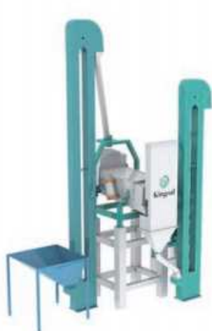
Maize intaking and Sifting

T series can produce maize flour(it's also called sembe or breakfast meal ) and Maize grits both, To suitable the market more widely.