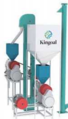
Conditioning and Degerminating