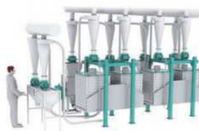
Sifting and Packaging

Double-Bin plansifter and Manual Packing unit